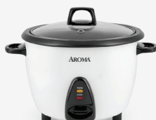
Rice & Grain Cookers