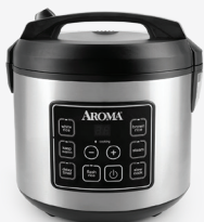
Digital Rice & Grain Multicookers