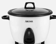
Rice & Grain Cookers