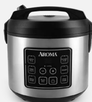
Digital Rice & Grain Multicookers