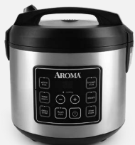
Digital Rice & Grain Multicookers